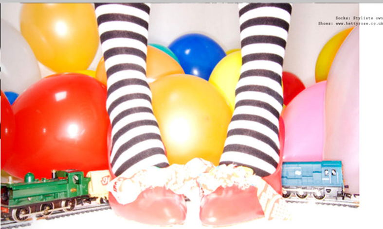
Socks: Styliste own Shoes: www.bettyrose.co.uk