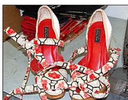
Shoes made from reclaimed wood, vintage fabric and old ballet shoes