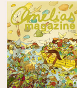
Amelia's Magazine Issue 10 £12.99