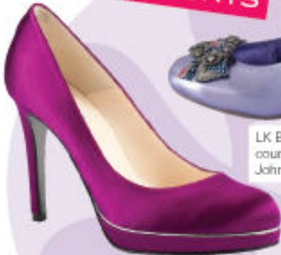
LK Bennett pink court shoe, £180, John Lewis