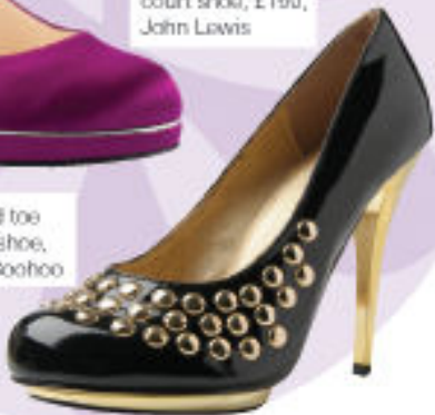
Round toe court shoe, £30, Boochoo