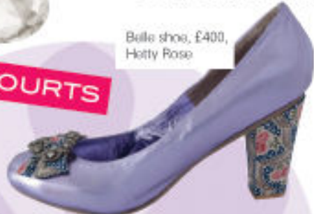
Belle shoe, £400, Hotty Rose